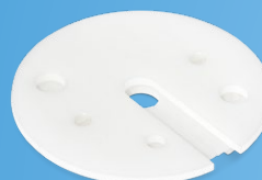
Low-evaporation vessel covers are included