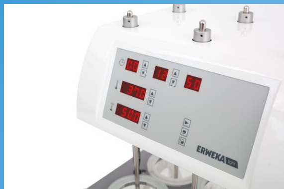
LED display and symbol keypad for easy control