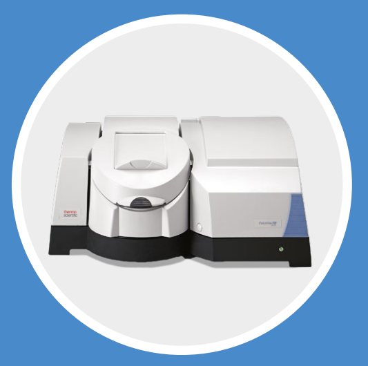
ThermoFischer spectrophotometer for DT Online UV/VIs System