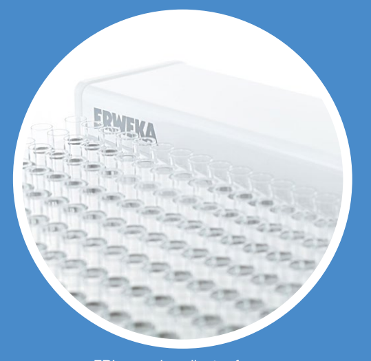
FRL sample sollector for DT Offline System