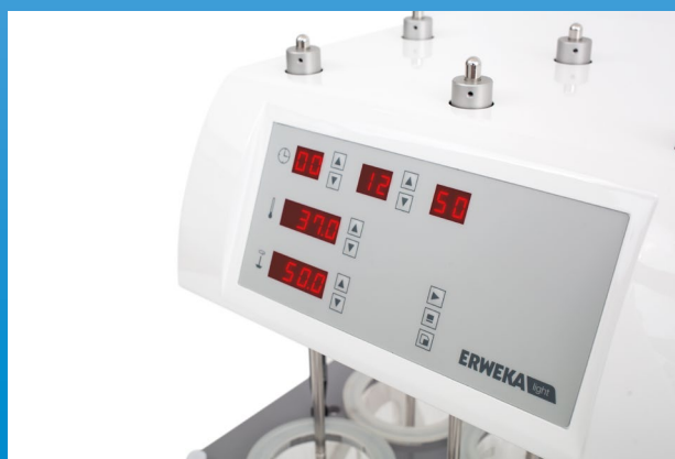
LED-display and symbol keypad for easy control