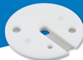
Low-evaporation vessel covers are included

Dimensions (width / depth/ height): 510 mm / 450 mm / 660 mm / 30 kg (weight)