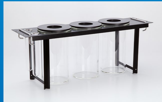
1000 ml vessel with vessel holder