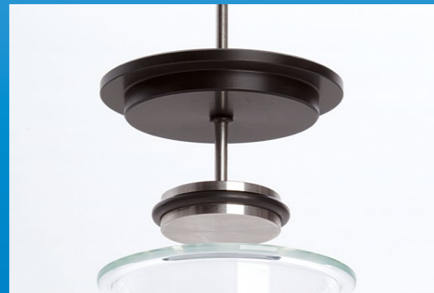
300 ml vessel with vessel holder