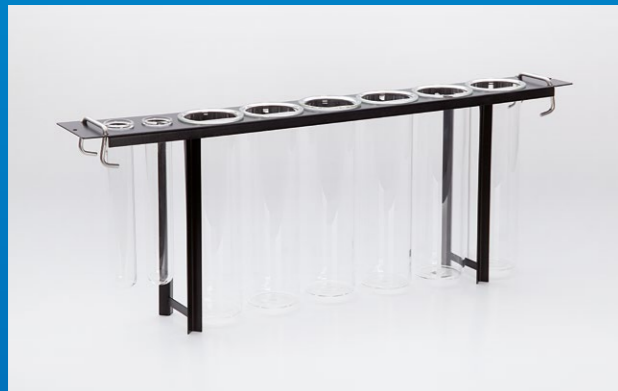
300 ml vessel with vessel holder