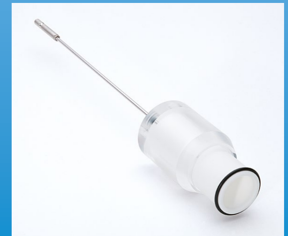
Cylinder Transdermal Holder